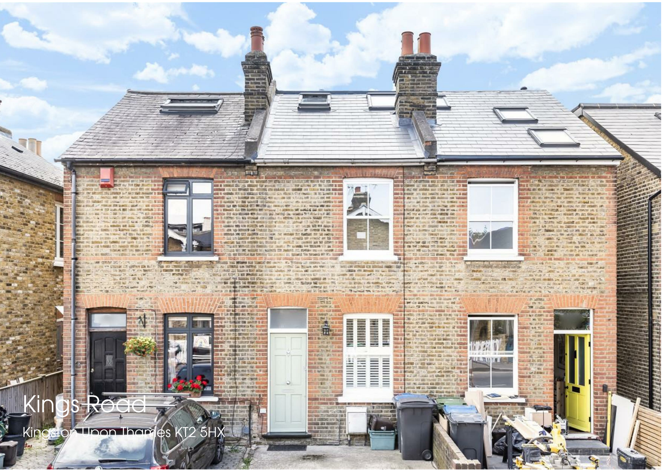
Kings Road Kingston upon Thames KT2 5HX

34 Richmond Road Kingston upon Thames Surrey KT2 5ED www.gibsonlane.co.uk Tel: 020 8546 5444